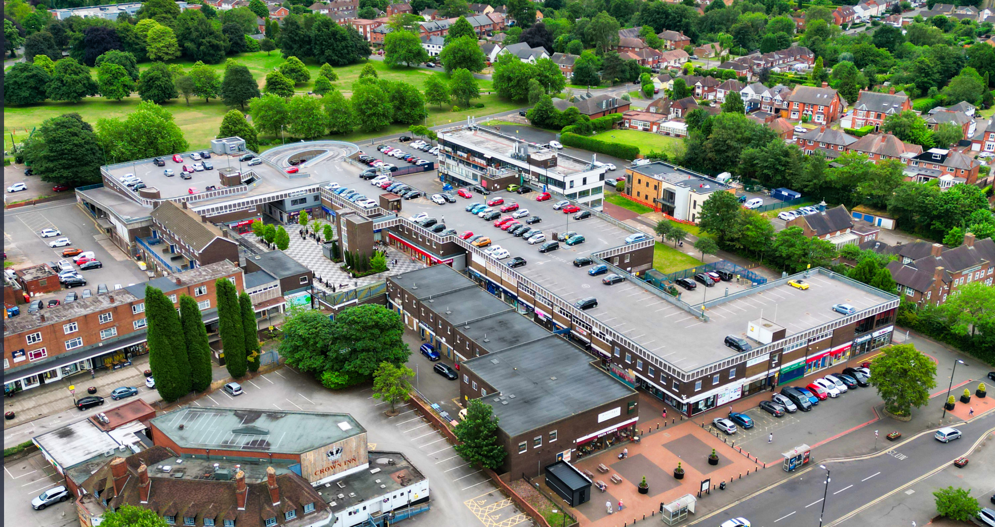
Aldridge Shopping Centre, Aldridge, West Midlands WS8 8QP