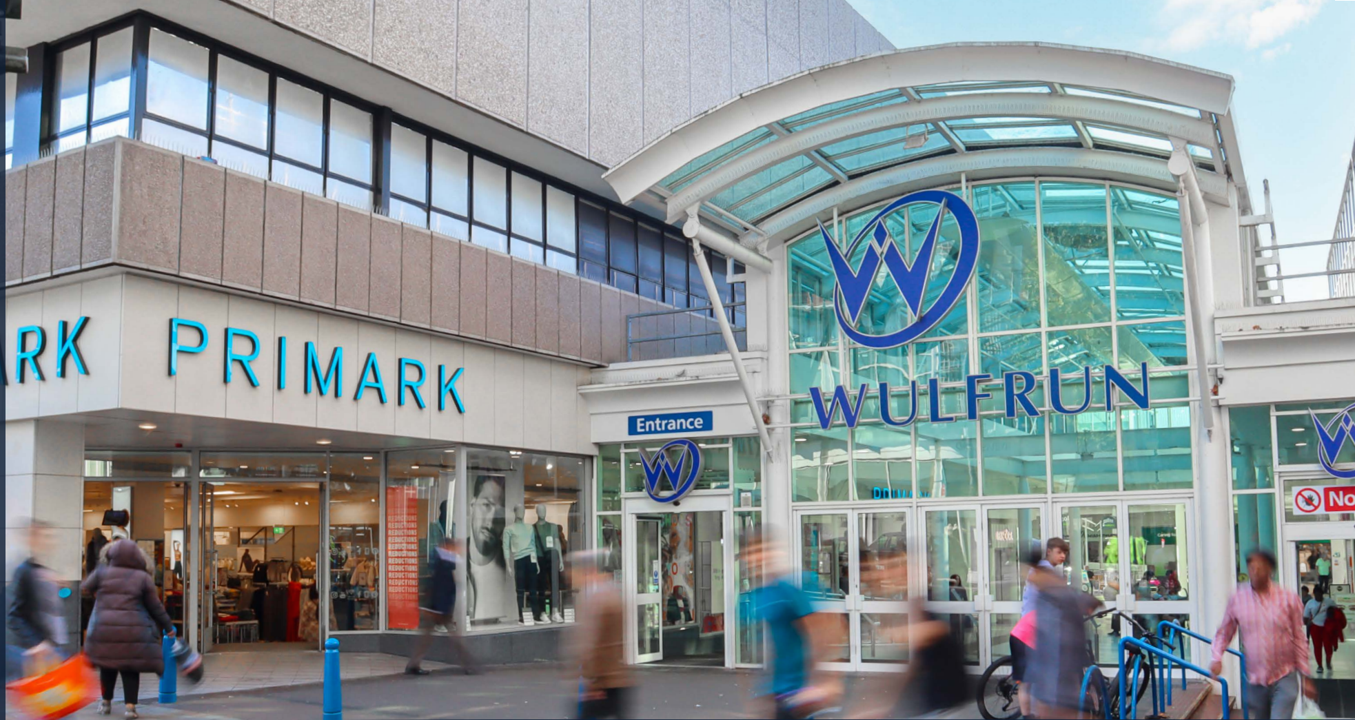
Wulfrun Shopping Centre, Wolverhampton, West Midlands WV1 3HH