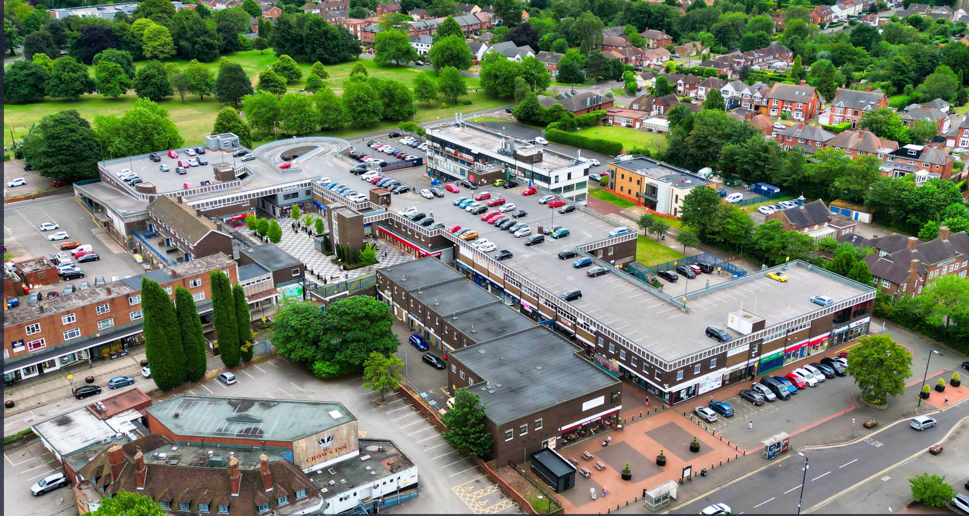
Aldridge Shopping Centre, Aldridge, West Midlands WS8 8QP