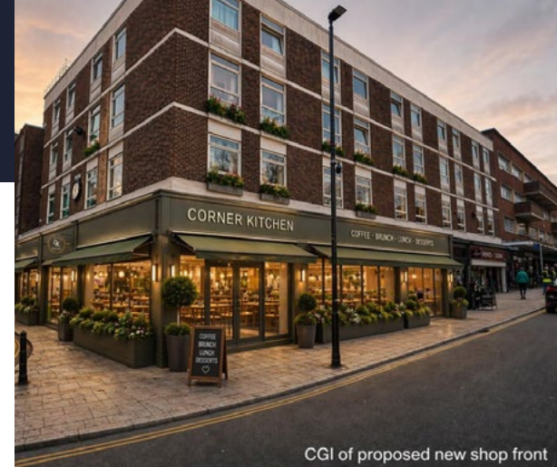
CGI of proposed new shop front

Each party is responsible for their own legal costs in connection with the granting of a lease.