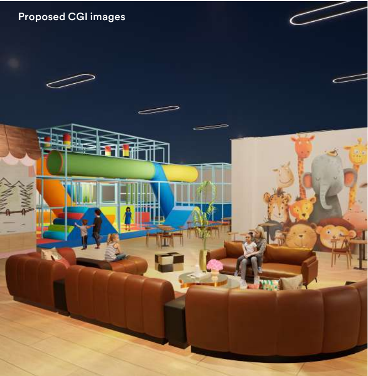
Proposed CGI images