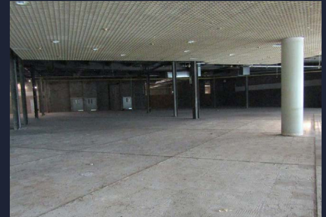
Second Floor Space