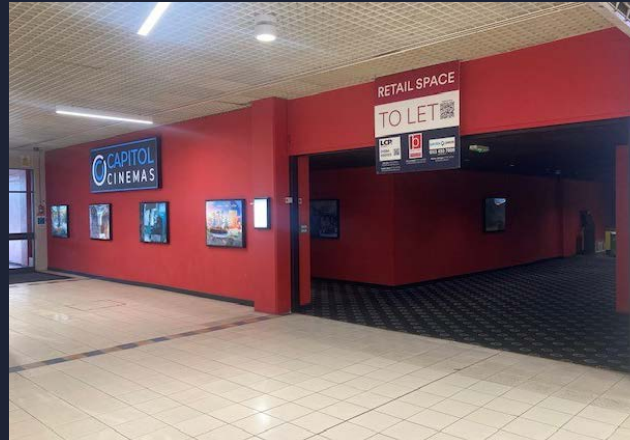
Unit 77 & 79